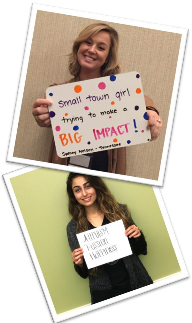
Photo Release Waiver

Please submit your photos with a signed release form so that your photos can be seen at the NSNA Convention in Dallas, Texas, April 5th - 9th.